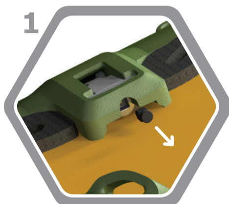
Remove the bolt plug from the rear of the Lock