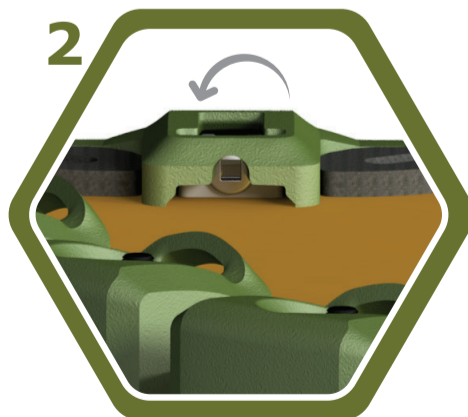
Using a torque wrench or impact driver, rotate in an anti-clockwise direction to release the Wing Shroud off the bucket side wall until the spacer movement reaches a dead limit