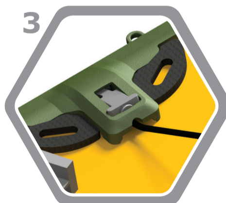
Insert a pry bar from the rear of the Lock and lever it out of the Wing Shroud