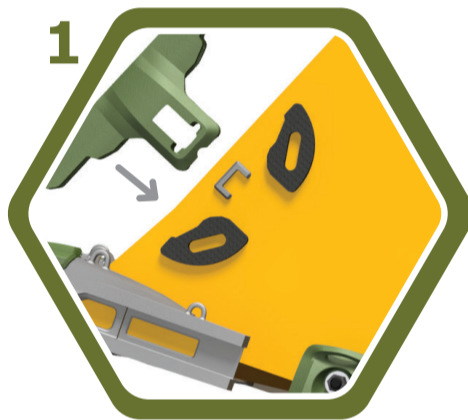
Slide the Wing Shroud onto the bucket side wall and over the Boss