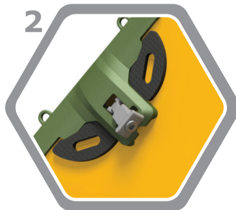
Insert the Lock into the lock cavity of the Wing Shroud. Manoeuvre the Wing Shroud until the Lock drops into place