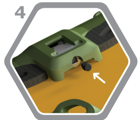
Insert bolt plug by pressing firmly into the rear of the Lock