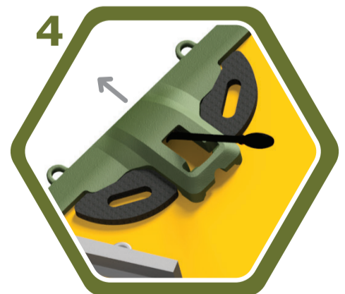
Use a pry bar to push the Wing Shroud off the bucket side wall