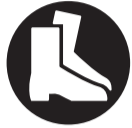
Safety work boots