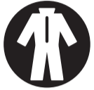
Full length clothing and work gloves