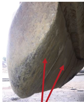
Wear Indicator Location

Lockjaw wear indicators will break through bottom of the shrouds. Corners should be inspected from underneath as they will not always break through on the side (as per other products in the market). Once wear indicators are visible it is advisable to change worn shrouds at next opportunity to reduce the risk of shrouds peeling off during operation.